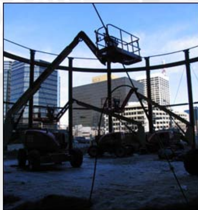
Prudential Center North/East Entry Cylinder Steel Framing