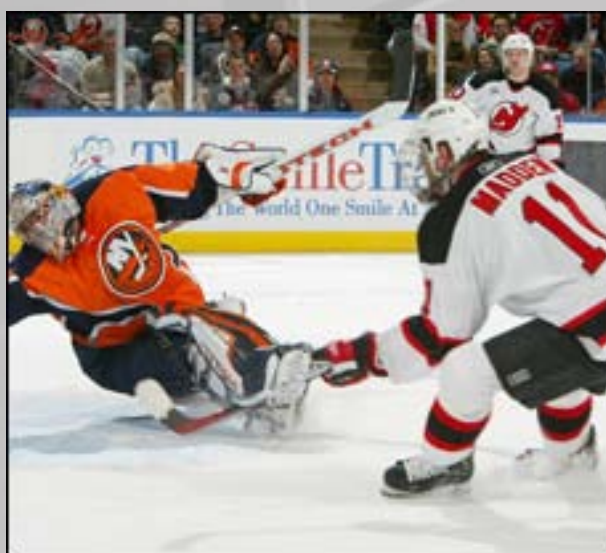
FEB. 17, 2007 - DEVILS 2, ISLANDERS 0 John Madden scores the game-winning goal against Rick DiPietro with a cross-ice pass from Erik Rasmussen.