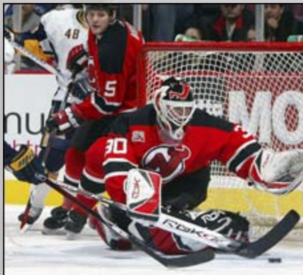
FEB. 3, 2007 - DEVILS 3, SABRES 2 Martin Brodeur makes a save against Jason Pominville and Colin White defends against Daniel Briere of the Buffalo Sabres.